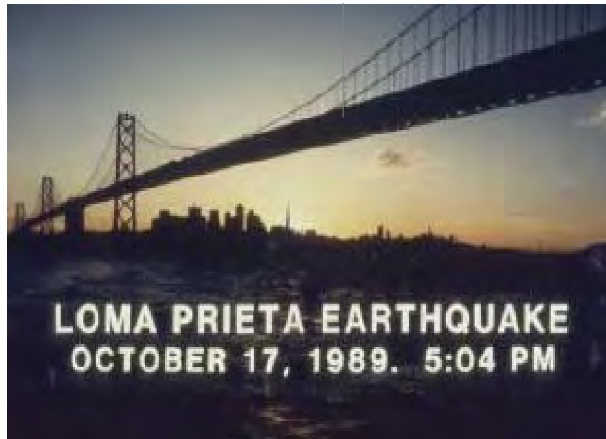
PROP 1B FUNDING TO IMPROVE THE ABILITY OF FERRIES TO RESPOND IN THE AFTERMATH OF A DISASTER.

WETA received a $25 million project award for fiscal year 2007/2008 from the Governor's Office of Homeland Security. This award will provide funding for projects to increase our region's ability to maintain a prolonged ferry emergency response and provide maximum flexibility during a disaster. Of these funds $15 million will provide funding for planning, design and construction of new ferry terminals for SSF, Berkeley, Hercules, Redwood City and Antioch/Martinez ferry projects. An additional $10 million is provided to enhance our region's permanent and deployable ferry maintenance and fueling projects.