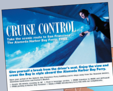
ADVO/ Newspaper Insert

The campaign launched September 9 in two parts. First, Harbor Bay Farm Island residents and surrounding neighborhoods received a direct mail piece promoting free round trip ferry tickets. Phone calls and email responses were tracked and a database created to stay in touch with customers. This program was supported with newspaper ads and signage at key locations. A WTA representative spent a